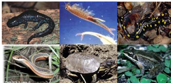
Ribbon Snake/Wood Turtle/Wood Frog

There are many ways that you can help and become a part of Blandings Park Wildlife Sanctuary, a 501 © 3 public charity grassroots land trust: