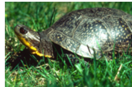
Our Mascot, the Blanding's Turtle

BPWS is a 501(c)3 public charity land trust created and dedicated to preserve and protect all species through conservation, education, recreation, and research for the betterment of all.