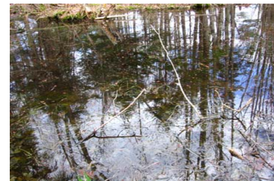
A Significant Vernal Pool

BPWS is a 501(c)3 public charity land trust created and dedicated to preserve and protect all species through conservation, education, recreation, and research for the betterment of all.